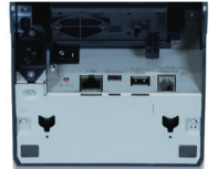
TSP100IV Multi-Connectivity Interfaces