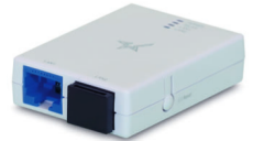
MCW10 Wireless LAN Module

The new TSP100IV from Star brings a unique new design for a truly revolutionary product. The quality and reliability of the popular TSP100 series has been fused with enhanced connectivity and specialist printing features for the very latest in point of sale and omni-channel commerce. For the ever-changing retail environment, the TSP100IV has every angle covered!